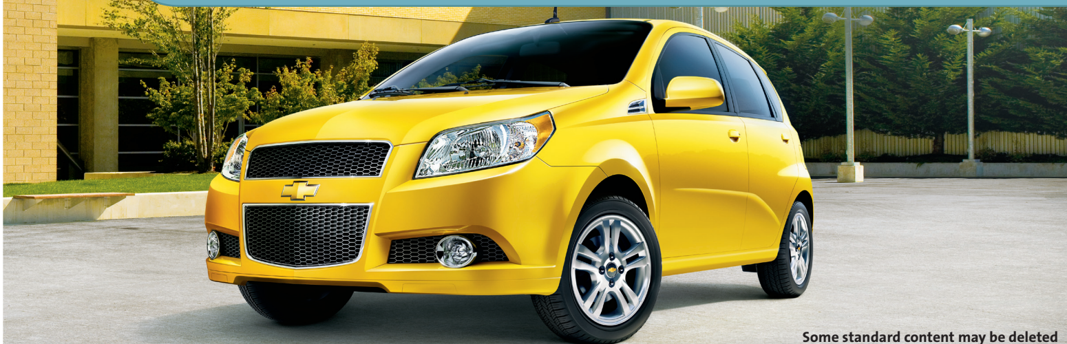
Aveo5 2LT in Summer Yellow (limited availability) with optional 15" aluminum wheels.

Whether you're looking for your very first new car or a great value on your next one, you are officially done shopping. The 2011 Chevrolet Aveo isn't a budget-buster; instead, it's filled with the kind of thinking, features and craftsmanship you'd expect to pay a lot more for. It has a roomy and versatile interior and is fuel-efficient, offering an EPA estimated 35 MPG highway. With the unmatched technology of OnStar ®1 and the Directions & Connections ® Plan standard for the first six months, Aveo is as smart as it is safe. And to guarantee the quality, Aveo is covered by the Chevrolet 100,000 mile/5-year 2 transferable Powertrain Limited Warranty plus Roadside Assistance and Courtesy Transportation Programs.