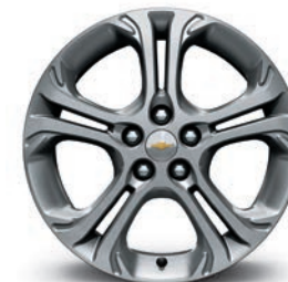
17" Painted-Aluminum (Standard on LT)