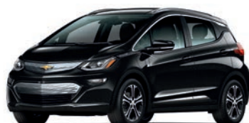
MOSAIC BLACK METALLIC (With Dark Silver Grille)