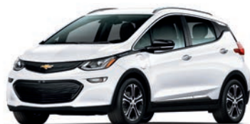
SUMMIT WHITE (With Black Grille)