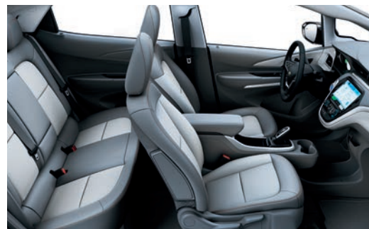
Light Ash Gray/Ceramic White Perforated Leather Appointments 6