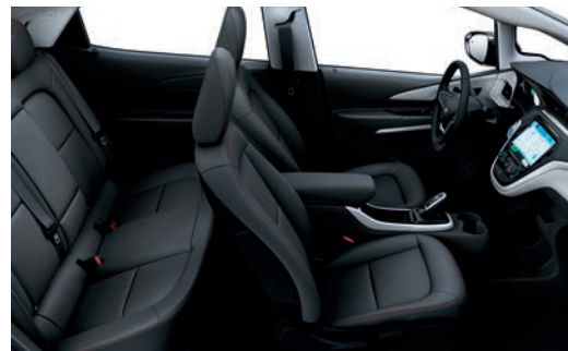
Dark Galvanized Gray Perforated Leather Appointments 6