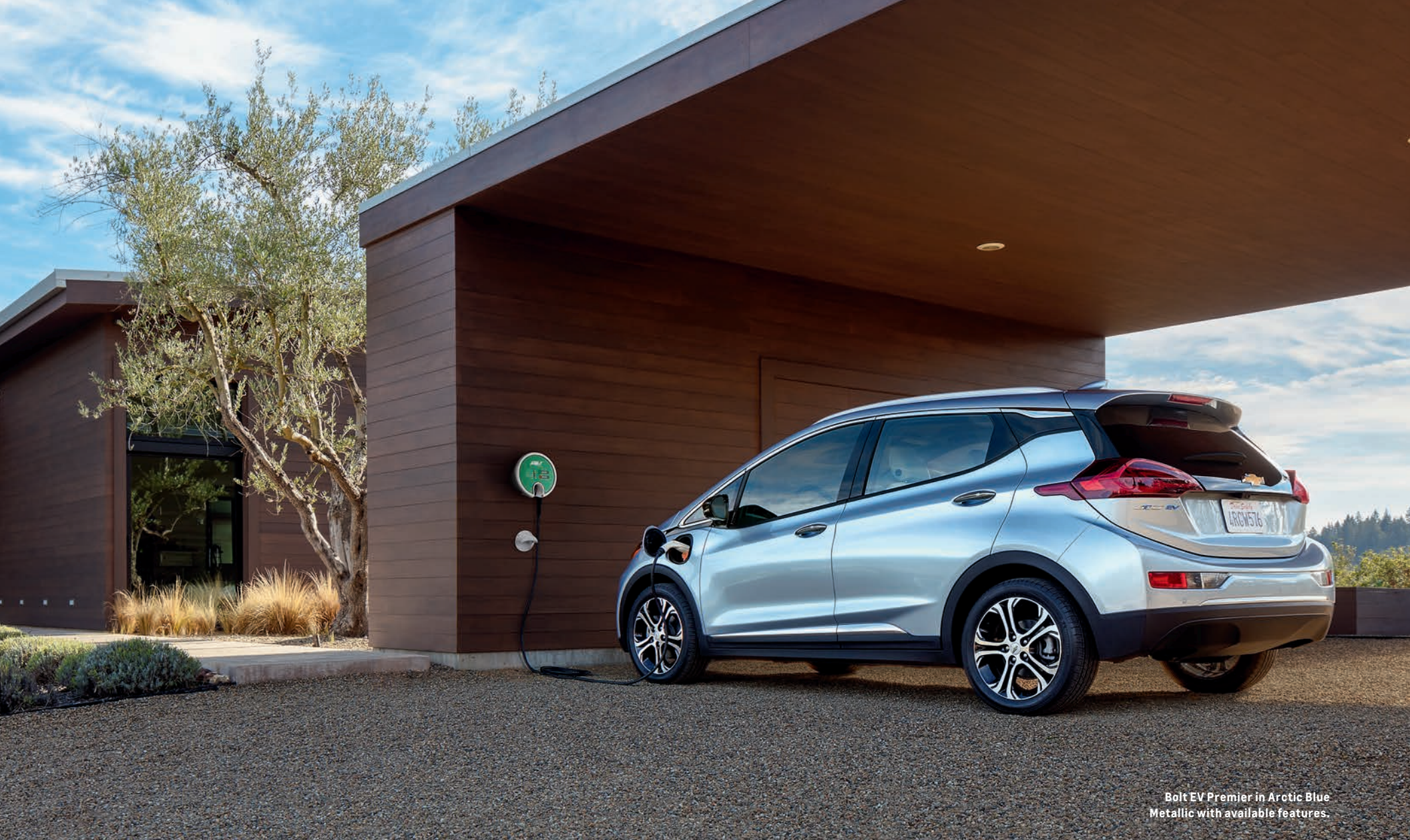
Bolt EV Premier in Arctic Blue Metallic with available features.