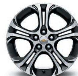
17" Ultra Bright Machined-Aluminum with Painted Pockets (Standard on Premier)