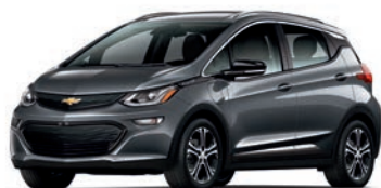
NIGHTFALL GRAY METALLIC (With Black Grille)