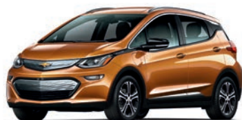
ORANGE BURST METALLIC 3 (With Dark Silver Grille)