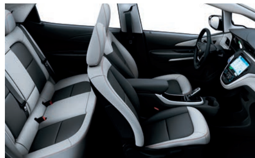
Dark Galvanized Gray/Sky Cool Gray Perforated Leather Appointments 6