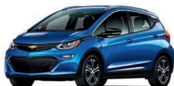
KINETIC BLUE METALLIC 3 (With Black Grille)