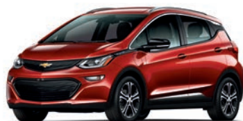
CAJUN RED TINTCOAT 3 (With Black Grille)