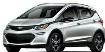
SILVER ICE METALLIC 1,2 (With Black Grille)